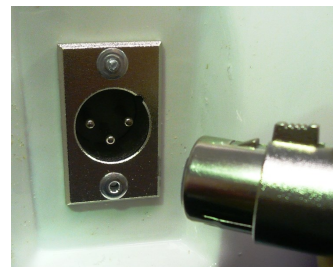
XLR connector and base socket

Please note: Use only the transformer supplied. Use of a different transformer may result in damage to the product and void the warranty.